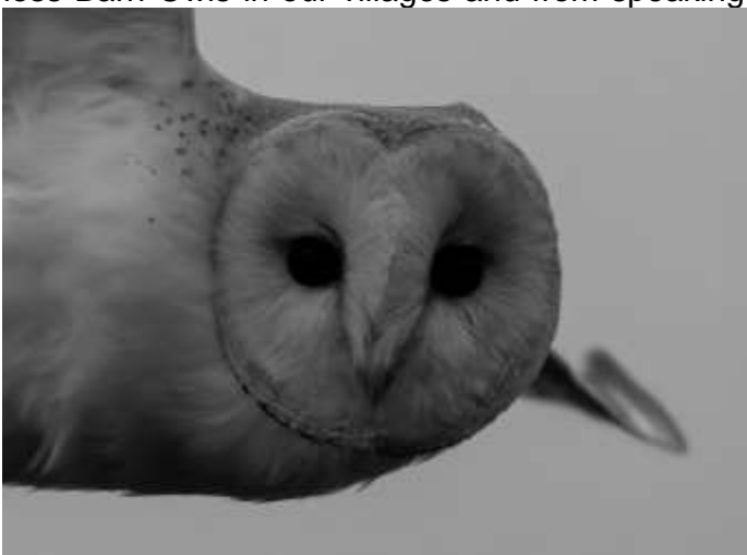
Barn Owl - Jon Kelf

Over the past couple of years I have been seeing less Barn Owls in our villages and from speaking