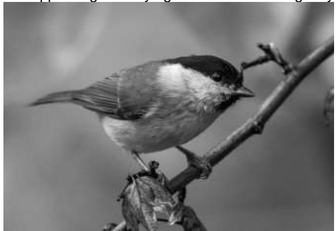
Marsh Tit

During September I was pleased to see a Marsh Tit appearing in my garden and visiting my